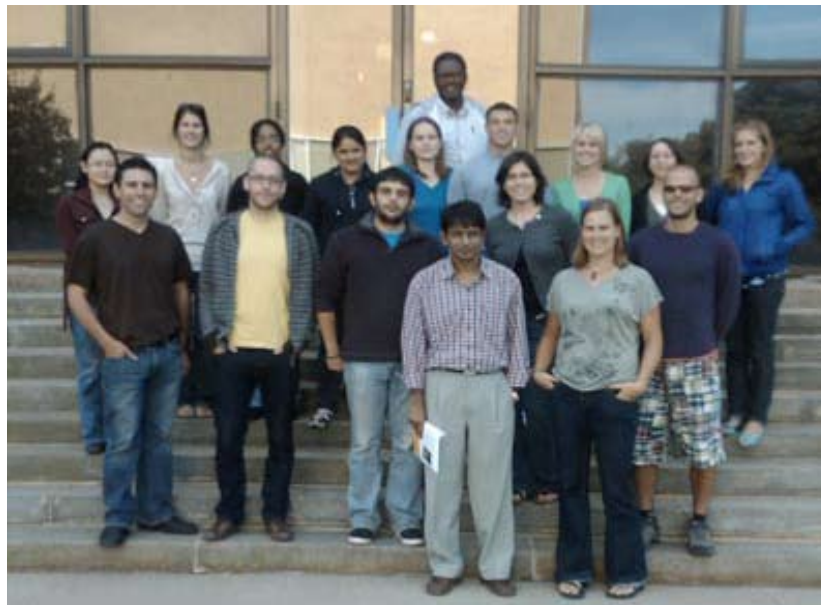
Research Group #1

a broader team effort. Where possible our group has developed standard operating practices (SOPs) for a variety of tasks. Within